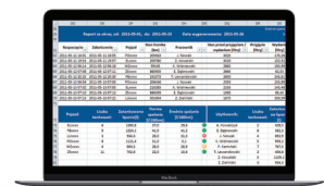
Kingspan Connect Dashboard sample

** One level authorisation also available