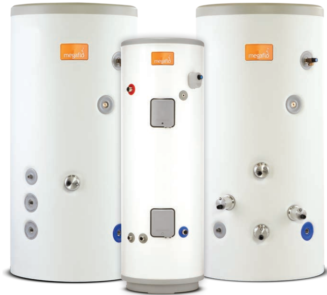
500 LITRE INDIRECT

Builds on Megaflö Eco by offering significantly larger capacity options, faster heat recovery times, doubling the flow rate. Direct and indirect solutions are available.