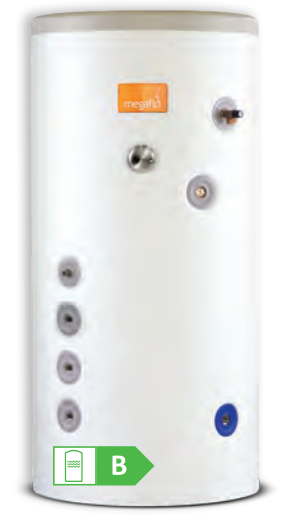
ECO SOLAR PV READY