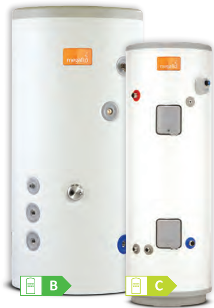
400 LITRE INDIRECT

Builds on Megaflō Eco by offering significantly larger capacity options, faster heat recovery times, doubling the flow rate. Direct (250/300 litre) and indirect solutions are available.