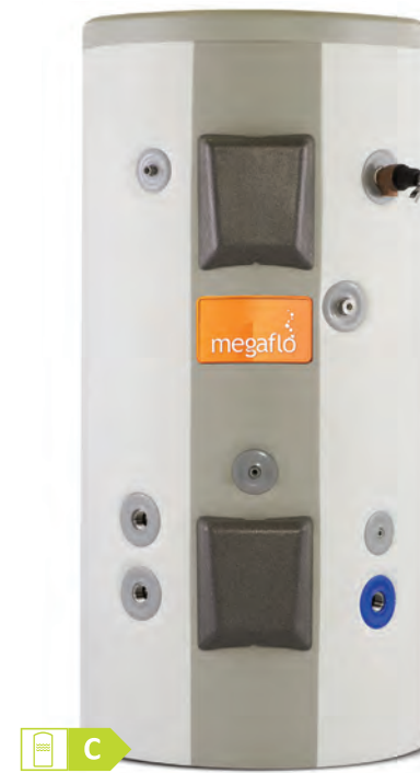
COMMERCIAL 500 LITRE INDIRECT

Designed for the most demanding applications such as hotels, leisure centres, office blocks and shopping malls, where there's often a need for lots of hot water very quickly, without loss in performance. The Megaflō Commercial calorifiers offer large scale, commercial capacity, heat recovery times and flow rates. Indirect cylinders and twin coil solar options are available.