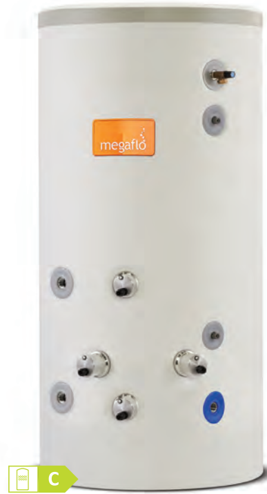
ECO PLUS FLEXISTOR 500 LITRE