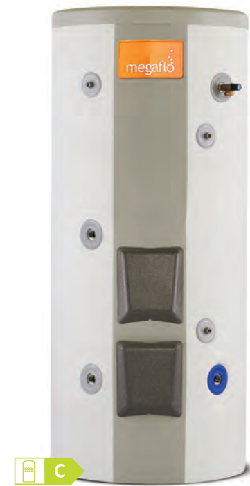
COMMERCIAL FLEXISTOR 500 LITRE