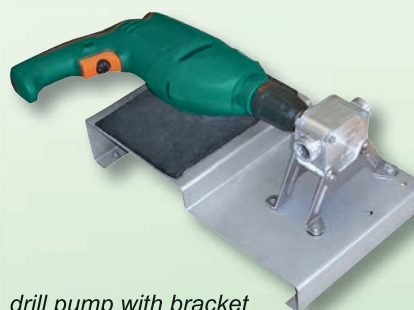
drill pump with bracket