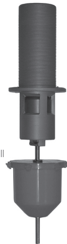
Figure 6: SpillStop overfill prevention device

It is recommended where possible, that the hole in the centre of the cone shaped valve be checked during each annual tank check for any blockages. This is visible when looking down into the 2" threaded connection.